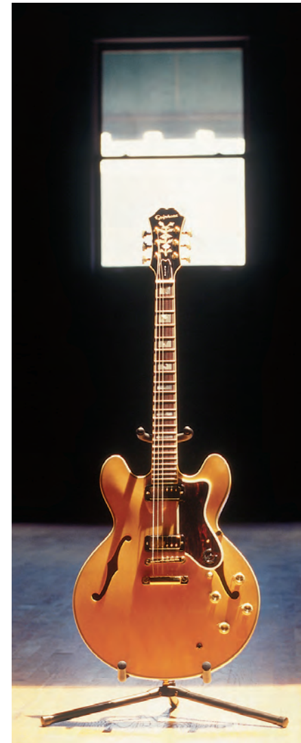
Crafted in Japan with choice tonewoods and US pickups, the launch of the Elitist Series in 2002 – including the Sheraton shown here – was conclusive proof that Epiphone is far more than Gibson's entry-level line.