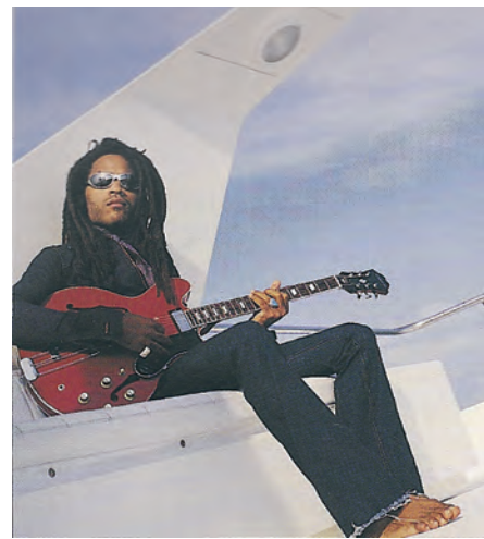
Hot rocker Lenny Kravitz modeling the latest fashion, an Epi Riviera.

It was a start. But as the 1990s rolled around, Epiphone still had work to do. The line was more than comprehensive – offering 43 different models across a range of styles and budgets – but the lack of historic Epiphone products needed to be addressed. The legendary instruments from Epiphone's past should have been leading the company's charge into the future. Without them, Epiphone was still