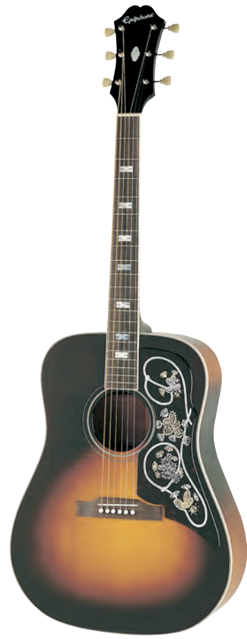
The 'square-shouldered' body shape was traditionally a design used by the Martin Company. In 1958, Gibson swallowed its pride and used it as the inspiration for the Epiphone Frontier flat top.