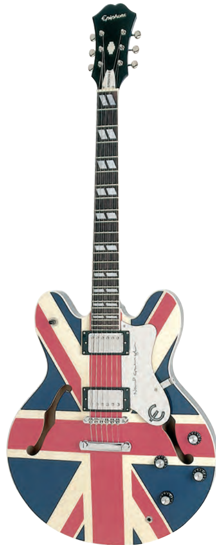
Perhaps the most iconic design of the 1990s, Noel Gallagher's signature model was almost as popular as Oasis themselves, and one of the decade's many highlights for Epiphone.

250 Excellente, Texan and Frontier flat tops. These Epiphones were only intended as a special event (it was impractical to move production to the US permanently) but the public reaction prompted Rosenberg to reissue many classic designs via the Korean range. Those who attended the 1994 NAMM witnessed the re-introduction of legends including the Casino, Riviera, Sorrento and Rivoli bass. In the months that followed, word spread, and guitar luminaries including Chet Atkins and Noel Gallagher signed up to the Epiphone cause – confirmation that these were instruments to be played through choice, not necessity.