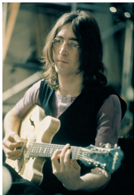
They loved them, yeah, yeah, yeah. When John Lennon, Paul McCartney and George Harrison each bought an Epiphone Casino in 1964, it underlined the quality of both the instrument and the brand.

Telecaster), and flat-top acoustics like the Frontier, whose square-shouldered body style was a first for Gibson (it was traditionally a Martin design). Combined with the introduction of amplifiers, it was becoming clear that Epiphone instruments would be far more than the 'sort of almost Gibsons' many had predicted.