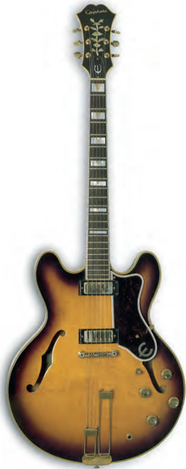
Released as part of the new line in 1958, the Sheraton was a daring model with shades of the Gibson ES-335, and revealed that the takeover would not spell the end of Epiphone's creativity.