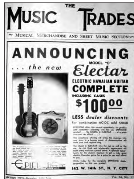
Announced in 1935, Epiphone's Electar range of electrics proved the company's flair for innovation. The 'Master Pickup' used on these axes was advanced for the time, with individually adjustable polepieces.

By this point, Epiphone guitars were considered to be amongst the best in the world, and Epi himself was enjoying the patronage of some of the most respected players on the scene. The Epiphone showroom – now returned to its early location on West Street, Manhattan – was both the company's HQ and a hangout for famous musicians. On Saturday