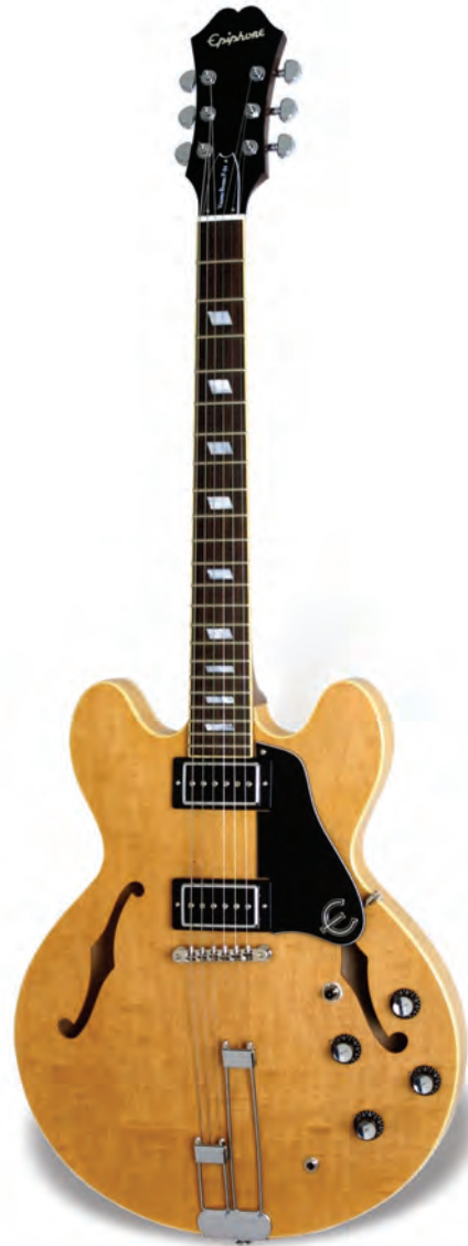
An update of an Epiphone classic, the Nick Valensi Riviera P94 is a blast from the past with a nod to the future. Much like the Strokes man himself...

In 2006, Epiphone is all things to all players. Working musicians prize the company for its Gibson replicas, offering the quality of the most famous US models at competitive prices. Collectors of vintage guitars snap up the authentic Elitist reissues of the Emperor, Casino and Excellente (and many more). Recording artists turn to the Epiphone US range for quality that rivals any guitar manufacturer in the world, while rock 'n' roll fanatics delight in the company's signature models, which in 2006 include everything from the Nick Valensi Riviera to the Zakk Wylde Les Paul Customs. Regardless of budget, ability or musical leaning, today's Epiphone line has it covered.