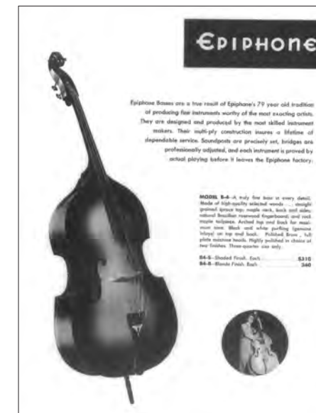
Even during the post-war slump, Epiphone enjoyed an unparalleled reputation for its upright basses. Models such as the B-4 prompted Gibson to buy the company for its bass operation in 1957.