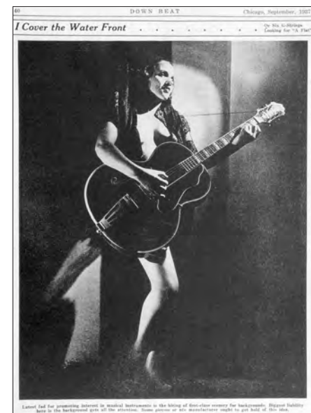
Size matters! In 1935, Epiphone launched the Emperor, a top-of-the-range f-hole archtop whose 18 3/8" body width was clearly motivated by a desire to list a bigger guitar than Gibson. This provocative ad campaign showed off the model's curves...

Throughout the 1930s, the rivalry between Epiphone and Gibson would veer from friendly sparring to all-out warfare. Slighted by the introduction of the Masterbilts, and having emerged from its commercial slump at the start of the decade, Gibson returned fire in 1934 by increasing the body width of its existing models and introducing the king-size Super 400 (named after its $400 price tag). Not to be outdone, Epi replied the following year with the top-of-the-line Emperor, which raised the stakes with a slightly wider body and a provocative advertising campaign featuring a semi-naked woman. In 1936, Epiphone struck again, increasing the size