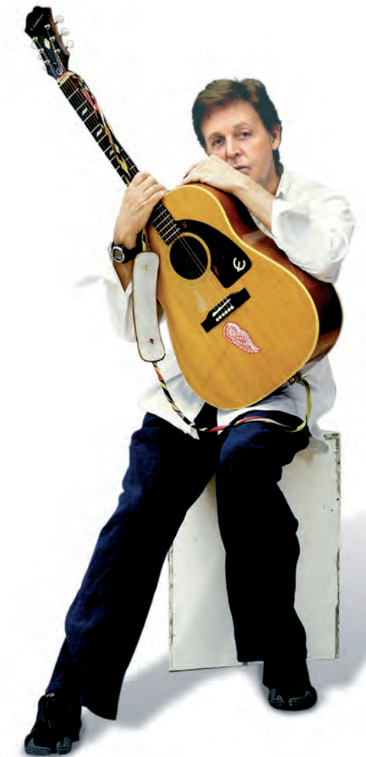
Paul McCartney used a 1964 Epiphone Texan on Yesterday – and the iconic status of the original instrument prompted Epiphone to launch a US reissue in 2005

By 2003, the international demand for Epiphones was such that the company had opened a new factory in China. Not only did this mark the first time that Epiphone had its own dedicated factory since the initial takeover by Gibson. Staffed by US managers and luthiers, it also armed them with the control over their own product that would let them take development to the next level, and give them a massive edge over the competition (most of whom continued to share workspaces).