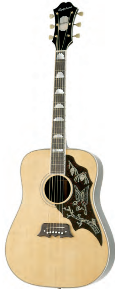
Proof that Epiphone was not secondary to Gibson came in the form of the 1963 Excellente – a deluxe flat top that actually cost $100 more than Gibson's esteemed J-200.