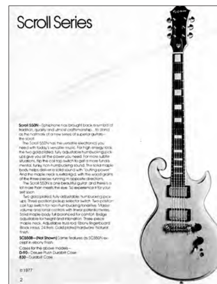
Early Japanese Epiphones had been poor, but the operation's growing momentum was demonstrated in 1976 by a number of new models, including a series of scroll-bodied electrics