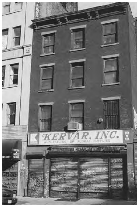
From 1907 to 1912 the Stathopoulos family lived and worked at 121 West 28th Street in Manhattan